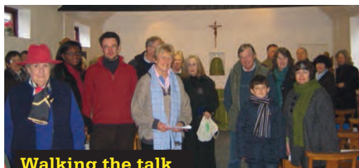
Walking the talk

More than 60 students at Cardinal Newman College, Harlesden, took action for water and livelihoods during their all-school mission in December. After finding out about the water we all use every day, the students chose one thing they could do differently to be more mindful of the water we all take for granted. If you'd like to book us for a workshop, please email campaigns@progressio.org.uk