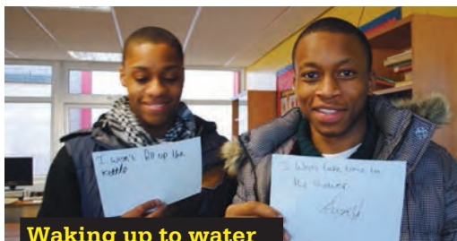
Waking up to water

More than 60 students at Cardinal Newman College, Harlesden, took action for water and livelihoods during their all-school mission in December. After finding out about the water we all use every day, the students chose one thing they could do differently to be more mindful of the water we all take for granted. If you'd like to book us for a workshop, please email campaigns@progressio.org.uk