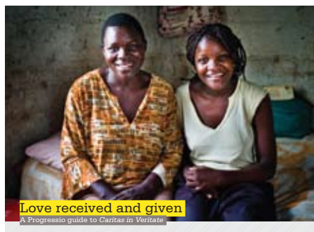
Love received and given A Progressio guide to Caritas in Veritate

Or you can order a printed copy direct from us – it's £2 plus 40p post and packing per copy. Please send a cheque payable to Progressio, along with your address details, to: CIV Guide, Progressio, Unit 3, Canonbury Yard, 190a New North Road, London N1 7BJ