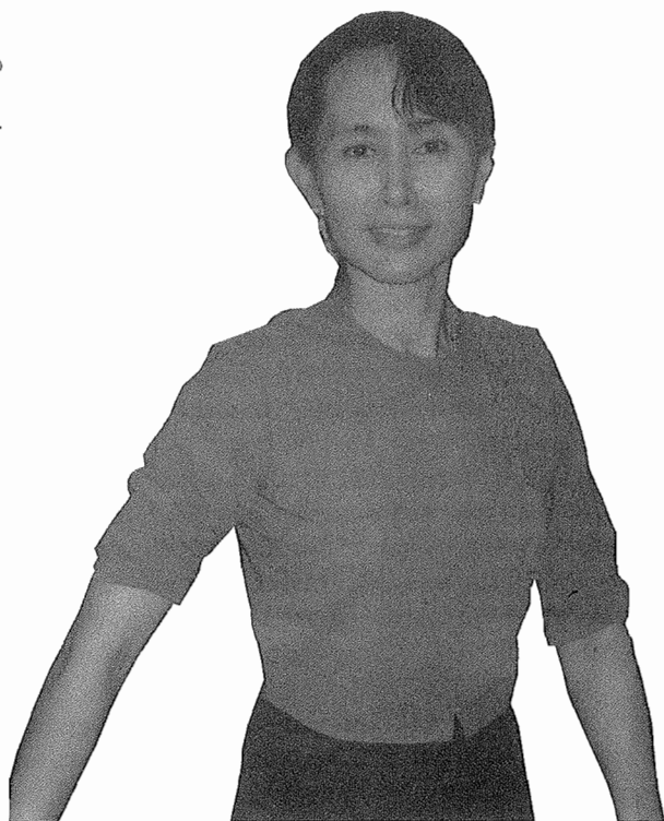
Daw Aung San Suu Kyi, General Secretary of the NLD, who was released from six years' house arrest but still faces severe restrictions on her movements and political activities.

Three decades of military rule have reinforced social barriers to women's involvement in politics. The military is both traditionally and culturally male-dominated and there are few women at senior levels.