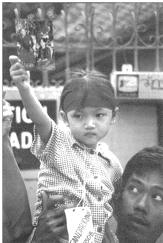
A Burmese girl demonstrates against the Burmese government in Bangkok, Thailand.