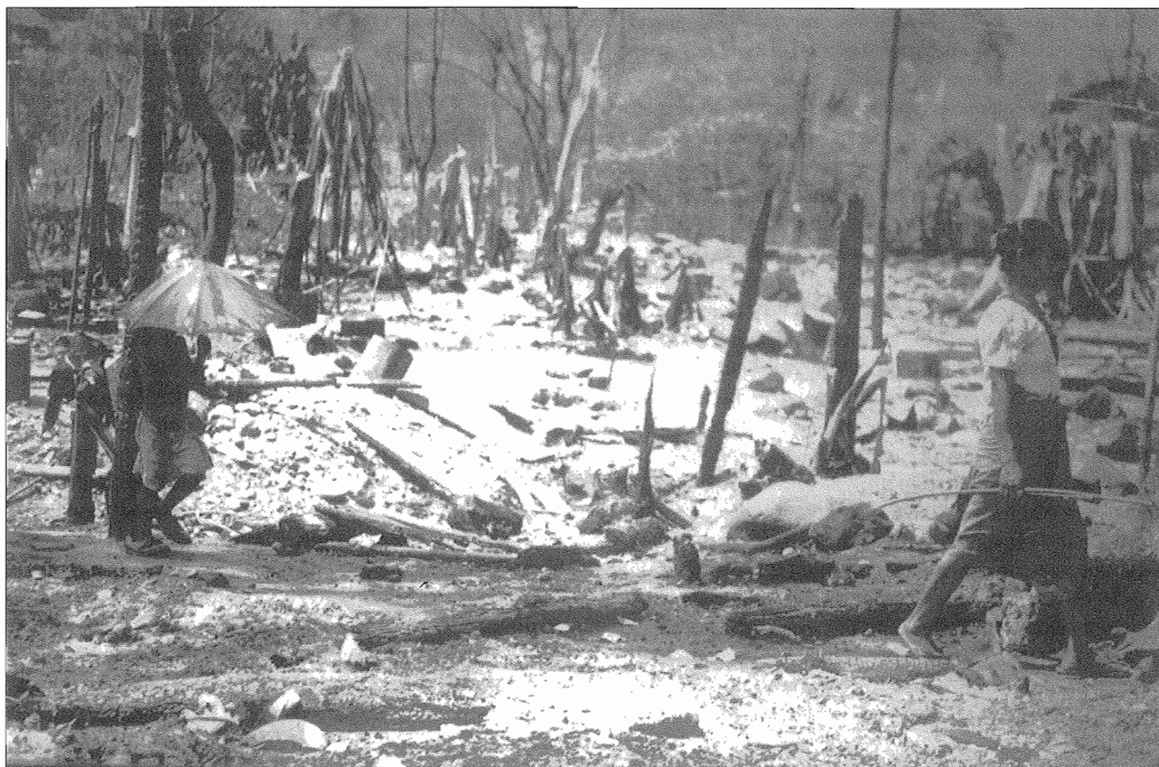
Ruins of a refugee camp, attacked and burned by SLORC troops on 28 April 1995. More than 700 homes were destroyed, making several thousand refugees homeless just before the onset of the rainy season. People can be seen wandering through the wreckage looking for any remaining belongings or usable items.

In April 1999 the Burma Border Consortium 158 estimated that there were 99,000 refugees in the camps on the Thai border, and a further 18,000 displaced persons near the border. 159 In 1997 Human Rights Watch reported that there were 1 million illegal migrant workers from Burma in Thailand. 160 Many are women working in the sex industry. Refugees report that life in the border states is worsening as the Tatmadaw steps up forced relocation. As there is little improvement in the situation inside Burma, large refugee flows are likely to continue.