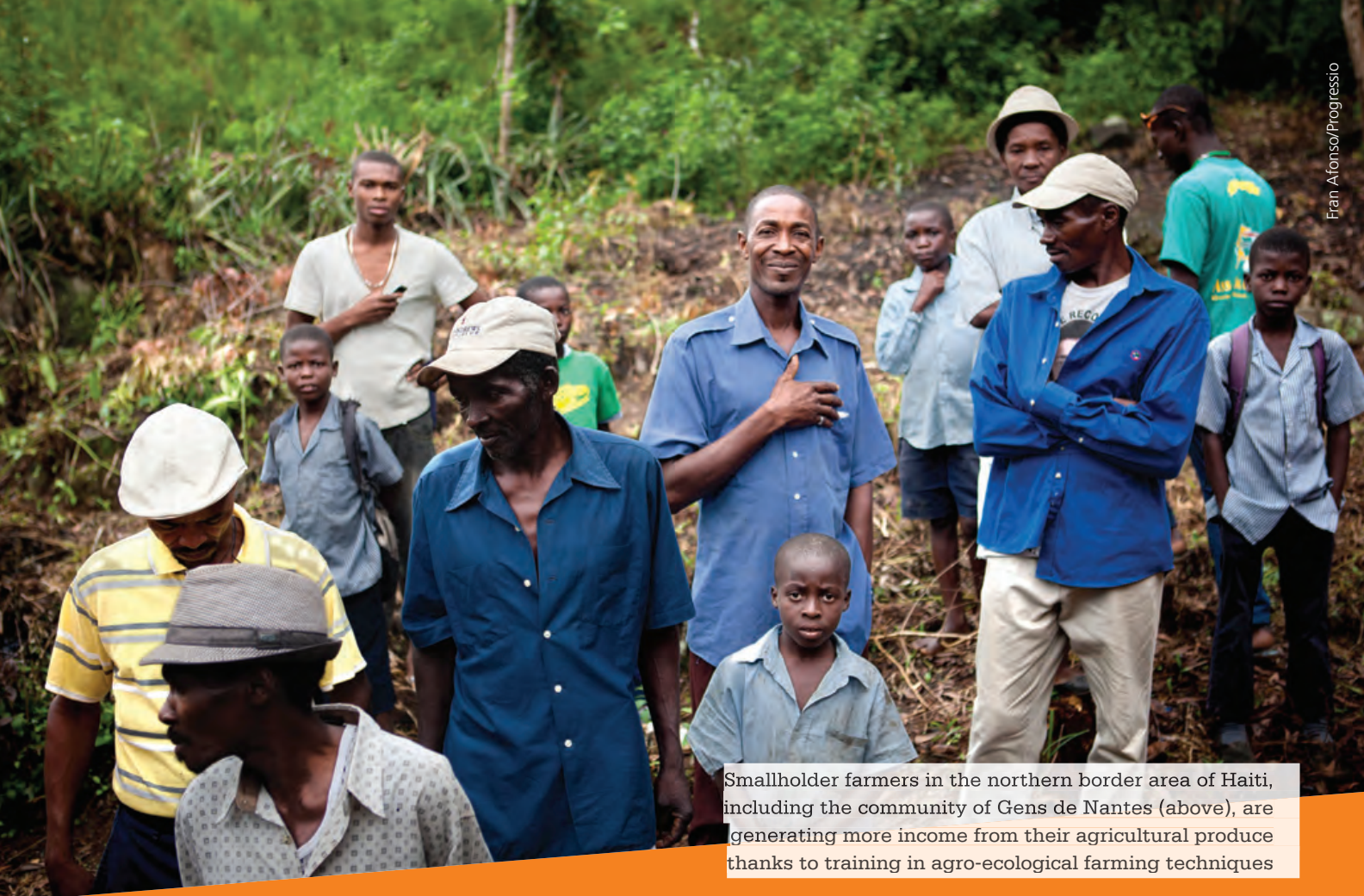
Smallholder farmers in the northern border area of Haiti, including the community of Gens de Nantes (above), are generating more income from their agricultural produce thanks to training in agro-ecological farming techniques